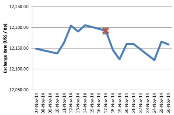
Figure 2. Changes of Exchange Rate (USD / IDR) Following November Price Increase Announcement