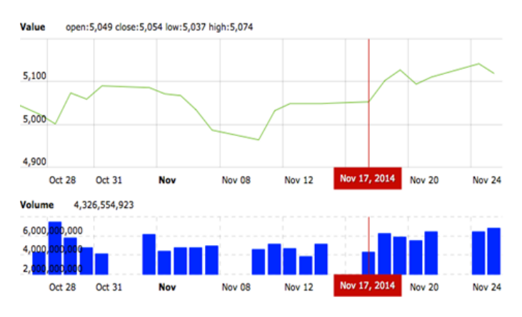
Figure 3. Jakarta Composite Index Following November Price Increase Announcement

Reducing energy prices is generally a popular policy, and Indonesia's January policy changes have been no exception. The one main criticism that has been levied